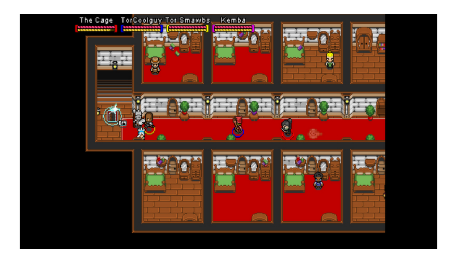
Mini's Magic World Download Under 1gb